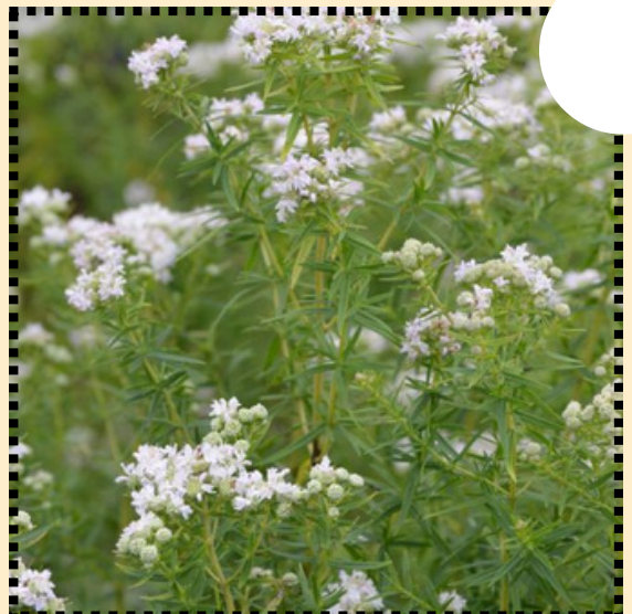
Virginia Mountain Mint