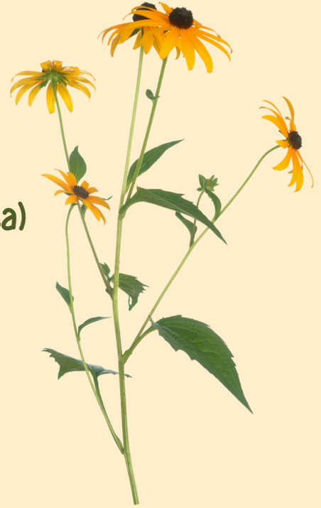
Sweet Black-Eyed Susan