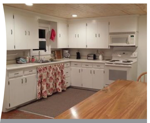
Above | A view of the cottage kitchen Below | Migration in process